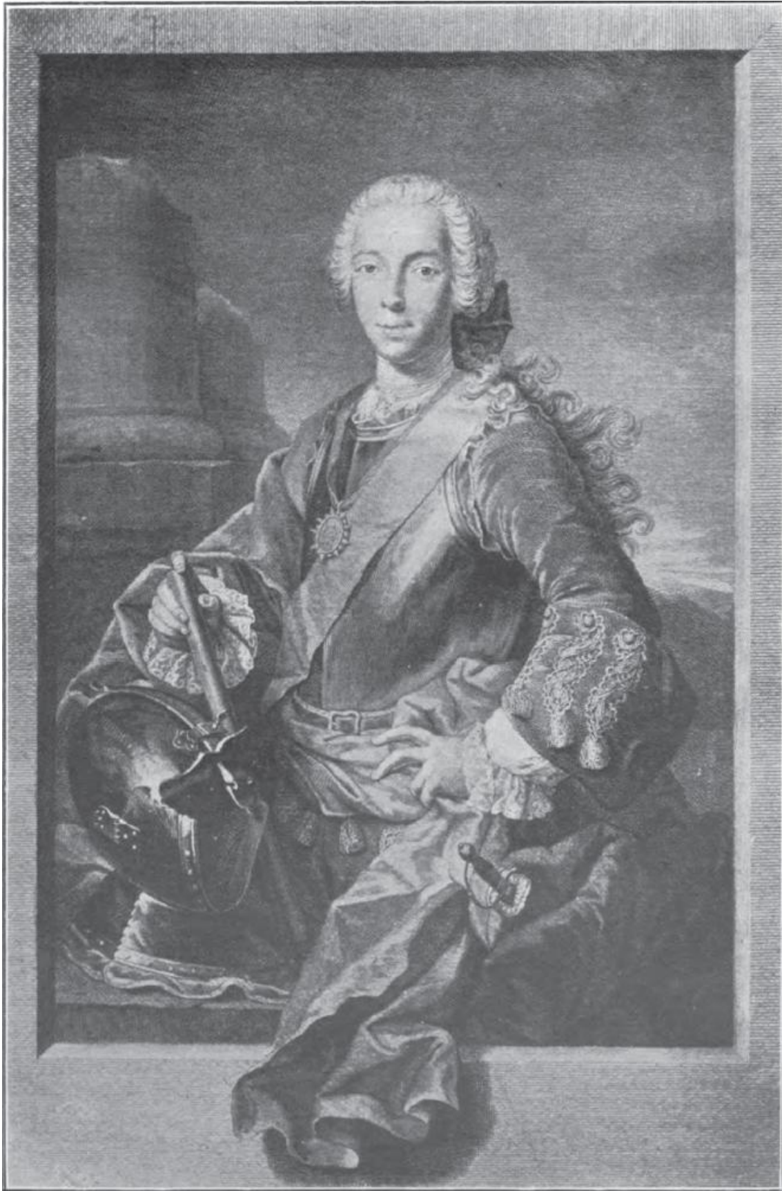
PORTRAIT OF PRINCE CHARLES EDWARD